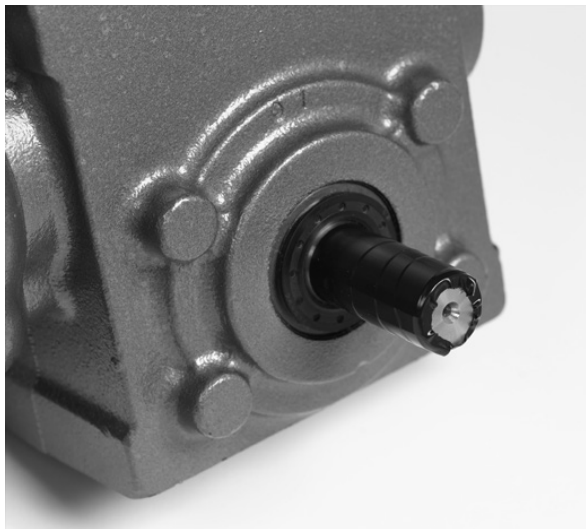
Figure 3 - Shaft Tape